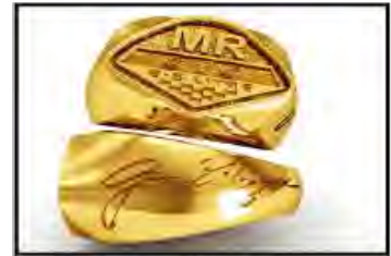
MR GTO signature ring.

Unique and one of a kind design for the Pontiac enthusiast.